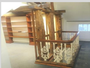
Open Plan Office