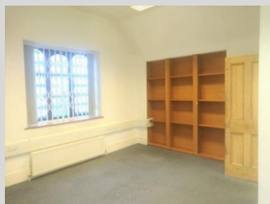
Open plan office