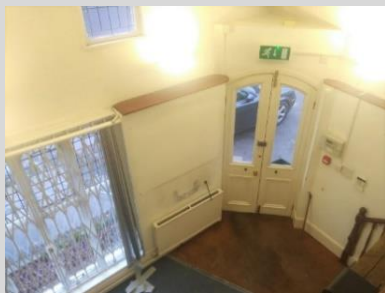
Entrance – Reception/Hallway